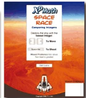
Space Race Comparing Integers