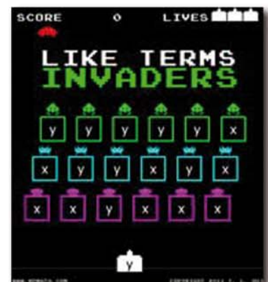
Like Terms Invaders